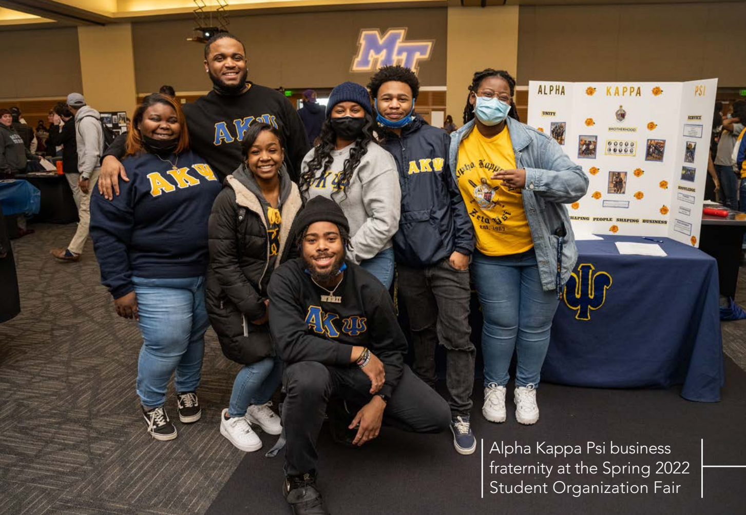
Alpha Kappa Psi business fraternity at the Spring 2022 Student Organization Fair