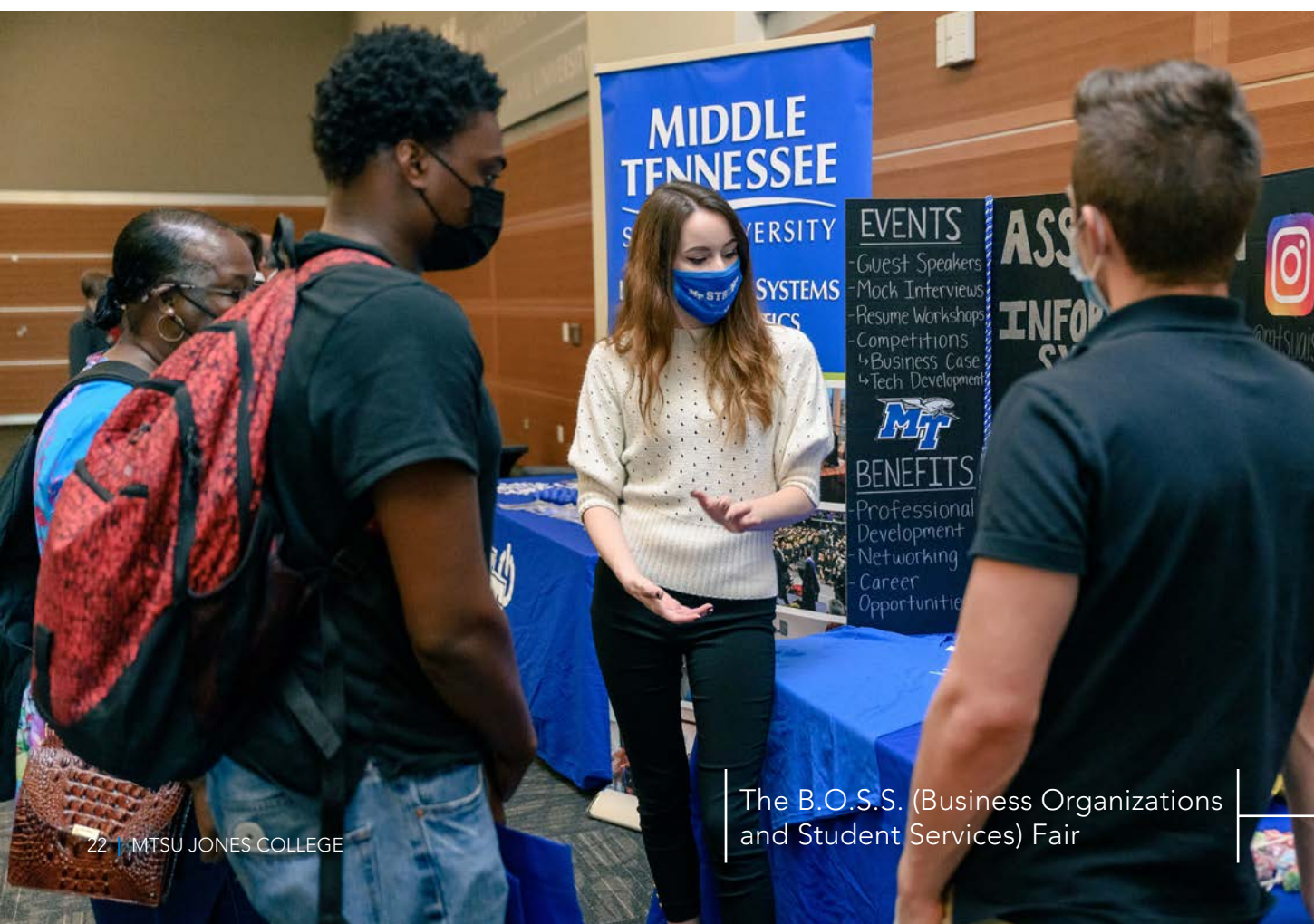
The B.O.S.S. (Business Organizations and Student Services) Fair