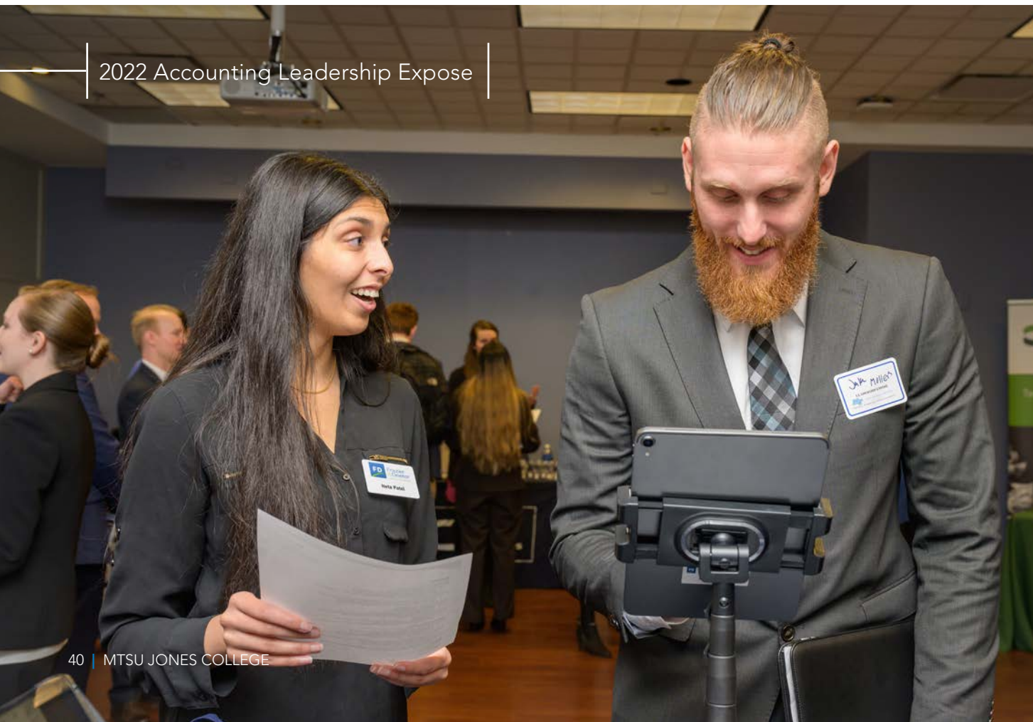
2022 Accounting Leadership Expose